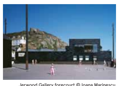
Jerwood Gallery forecourt

Stop of on your way in vibrant St Leonards where you can visit outdoor installations at The SPACE and modern and contemporary